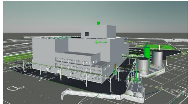
Figure 1: Arbiom's first plant design